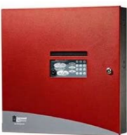
7100 Series Panel Fire Alarm Control Panel Installation/Operating Manual